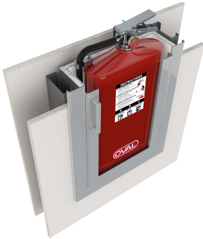
Model 10JABC shown installed in a fire-rated cabinet in a 3-5/8" studded wall