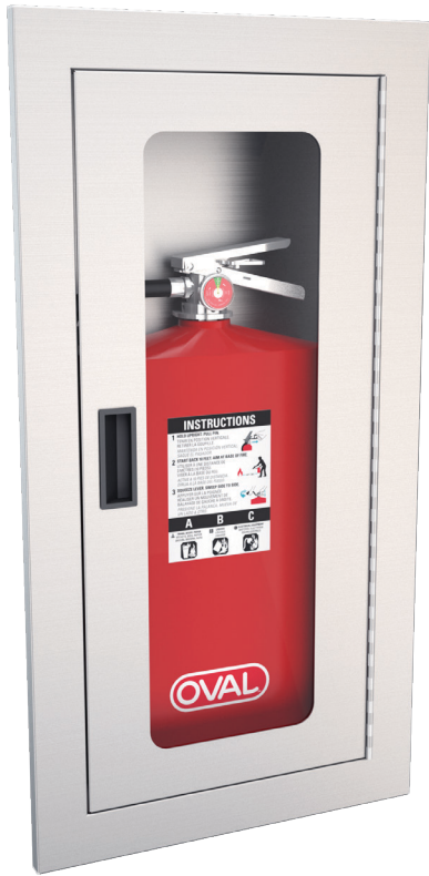
Shown with Oval model 10J-ABC fire extinguisher (sold separately).

Application: Recess mounted stainless steel cabinet for use with Oval Model 10J-ABC low-profile fire extinguisher (sold separately). Cabinet is rated for use in 2-hour fire-rated walls.