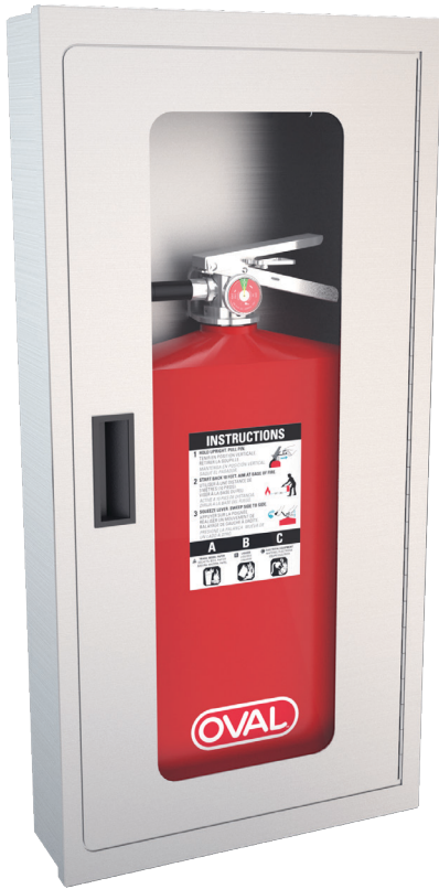
Shown with Oval model 10J-ABC fire extinguisher (sold separately).

Application: Surface mounted stainless steel cabinet for use with Oval Model 10J-ABC low-profile fire extinguisher (sold separately).