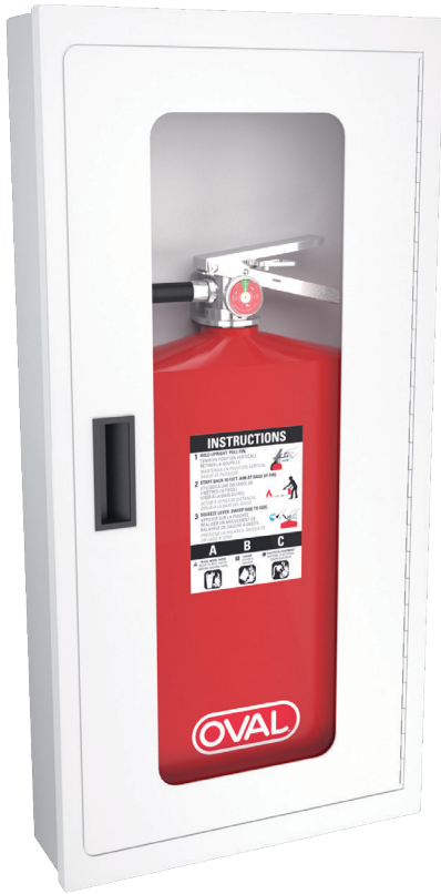
Shown with Oval model 10J-ABC fire extinguisher (sold separately).

Application: Surface mounted powder coated steel cabinet for use with Oval Model 10J-ABC low-profile fire extinguisher (sold separately).