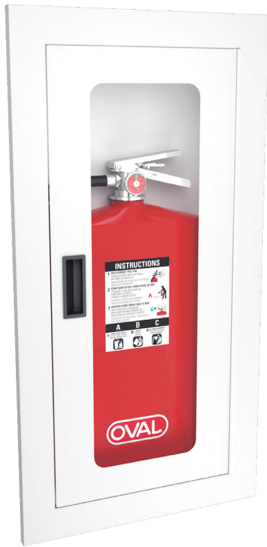
Shown with Oval model 10J-ABC fire extinguisher (sold separately).

Application: Recess mounted powder coated steel cabinet for use with Oval Model 10J-ABC low-profile fire extinguisher (sold separately).